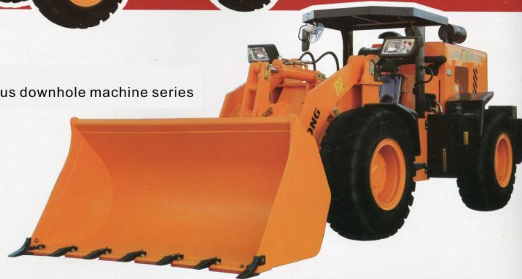
Various downhole machine series