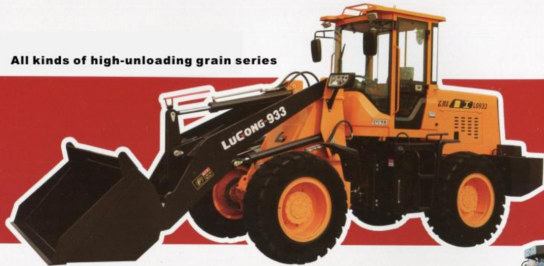
All kinds of high-unloading grain series