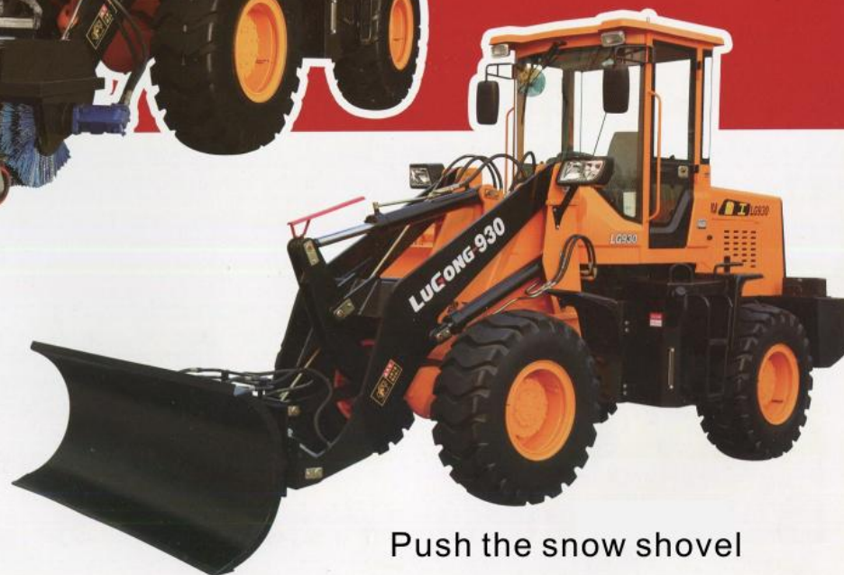
Push the snow shovel